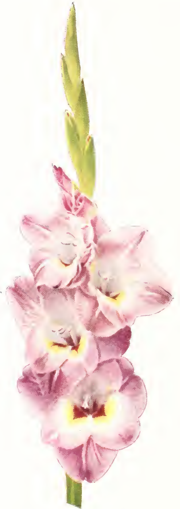
Glory of Kennemerland